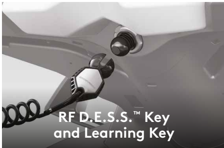
RF D.E.S.S.™ Key and Learning Key

29 gallons of storage space to stow important items while riding. 1