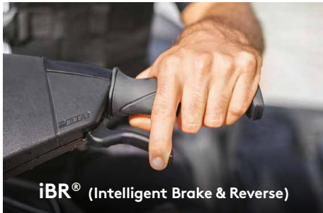
iBR® (Intelligent Brake & Reverse)

Exclusive to Sea-Doo®, iBR® stops the watercraft sooner and provides more control and maneuverability at low speeds and in reverse.