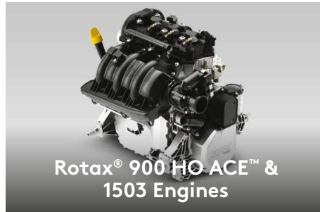
Rotax® 900 HO ACE™ & 1503 Engines

Exclusive to Sea-Doo®, iBR® stops the watercraft sooner and provides more control and maneuverability at low speeds and in reverse.