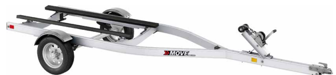
Aluminum MOVE I Extended 1250